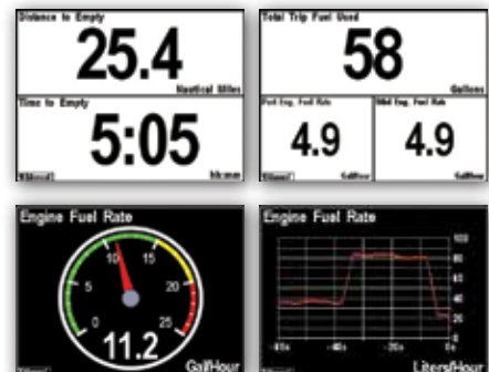
DSM Series Screen Shots